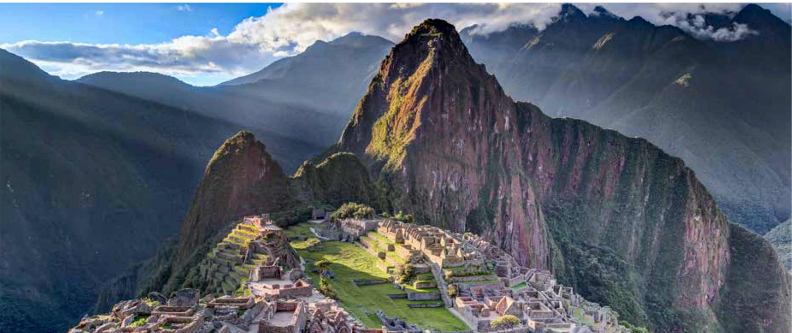
Machu Picchu, Peru

F ew trips offer as rich a combined experience of Peru's diverse natural and cultural riches. A luxury riverboat cruise into primeval rain forest takes us deep within the most biodiverse region of the Amazon Basin—the Peruvian Amazon boasts nearly a thousand species of birds alone! The vast Pacaya Samiria Reserve at the Amazon headwaters is home to a staggering array of wildlife, including the elusive jaguar and pink river dolphins. West into the high jungle-shrouded peaks of the Andes lies another marvel, this one of human origin: Machu Picchu, the mystical stone city built by the Incas in the 15th century, and below, the Sacred Valley of the Urubamba River, replete with myth and ruins. Discover it all on a diverse adventure designed to reveal Peru's most astounding wonders.