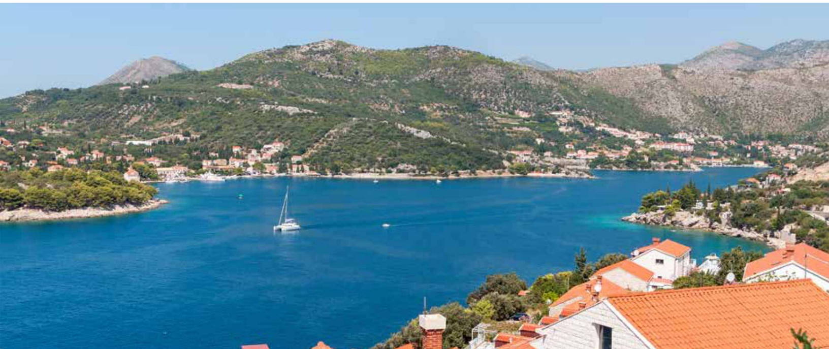
Zaton Bay, Croatia

Looking for a more remote European experience? With more than 1,200 islands along the sun-soaked Dalmatian Coast, plus rugged mountains and waterfalls inland, Croatia and Montenegro are beguiling destinations for the nature traveler. Via kayak and on foot, revel in the best scenery in the Mediterranean, exploring rocky headlands, sandy beaches, turquoise bays and red-roofed towns that cascade to the sea. From our private sailing catamaran we launch kayaks at a new destination each day, navigating intimate coves and exploring ashore. Dubrovnik and the villages of ancient Dalmatia are a highlight—cultural and architectural treasures as seductive as the landscape. But we don't stop there: This unique adventure also includes Montenegro's little-visited Durmitor National Park, where we hike among dramatic peaks, lakes, plateaus and some of the deepest gorges on Earth.