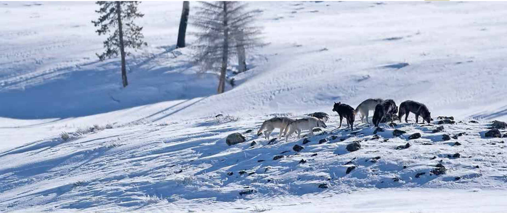
Gray wolves, Yellowstone National Park, USA

Y ou won't find a better chance to observe wolves in the wild than on this rare immersion in their native realm. Our custom-designed wolf and wildlife photography intensive spends five full days in the best spot on the planet for viewing wolves—and, if we're lucky, capturing images of wolf packs living freely in their natural environment: the famed Lamar Valley of Yellowstone's Northern Range. Though wolves are elusive and typically seen at a distance, the wide-open expanses of the Lamar offer the best prospects for sighting them. Through the relationships we've cultivated with local scientists, wolf researchers and renowned wildlife photographers, we are able to offer this exclusive photo safari for a few privileged guests keen for an intimate encounter with Canis lupus . If you're looking for an epic Yellowstone wildlife photography adventure, this is it!